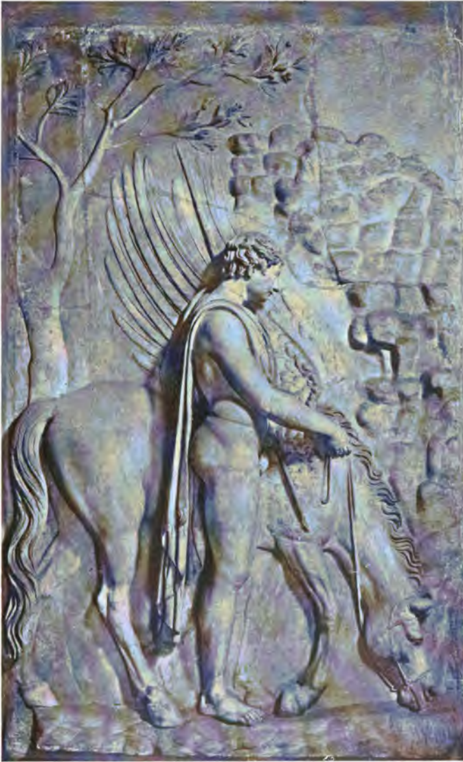
Fig. 76. Bellerophon and Pegasus.